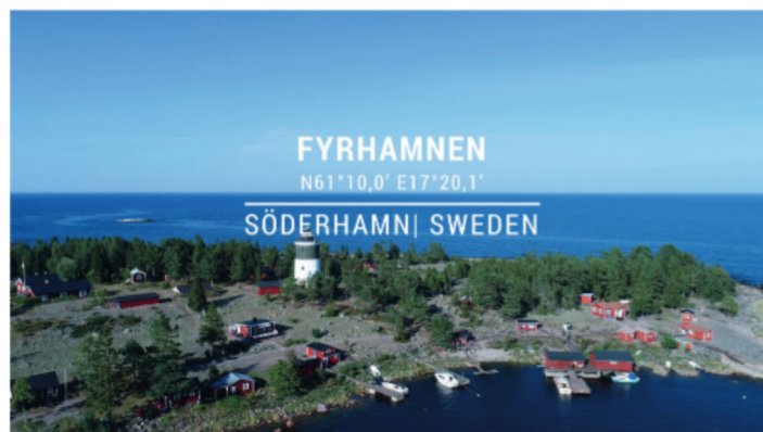
Fyrhamnen small port in Söderhamn

All the videos can be found on our website and in PortMate YouTube channel .