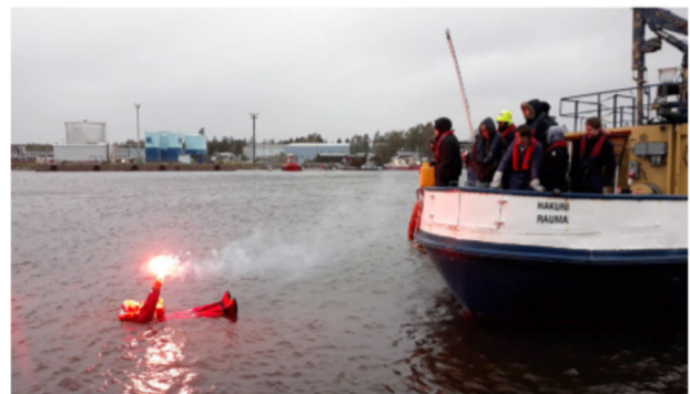
Instructions on how to use a hand flare were filmed in front of a live audience in Rauma, Finland.