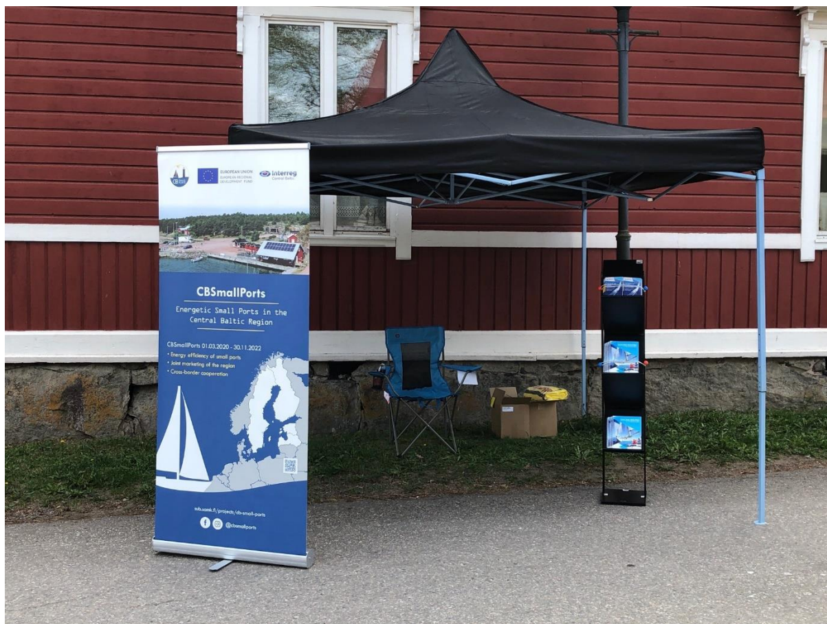
Photo 2. CBSmallPorts outdoor “booth” at Naantali floating boat show 2022