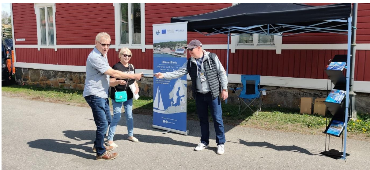
Photo 7. Giving out a CBSSmallPorts sailing guide at Naantali floating boat show 2022