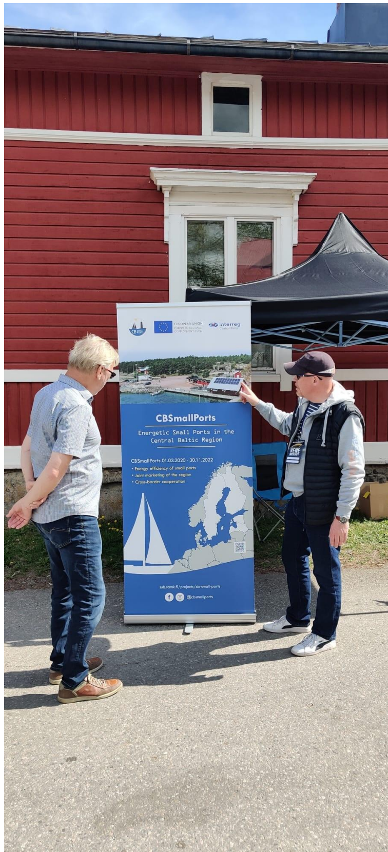
Photo 6. Visitor at CBSmallPorts outdoor “booth” at Naantali floating boat show 2022