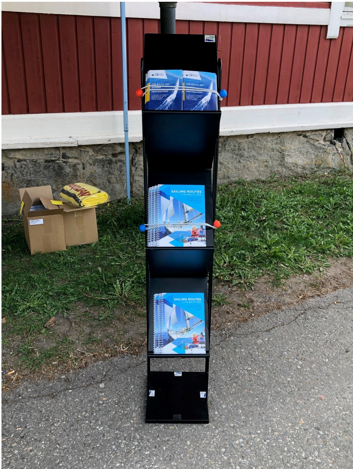
Photo 3. CBSmallPorts sailing guides and brochures at a brochure stand in Naantali floating boat show 2022