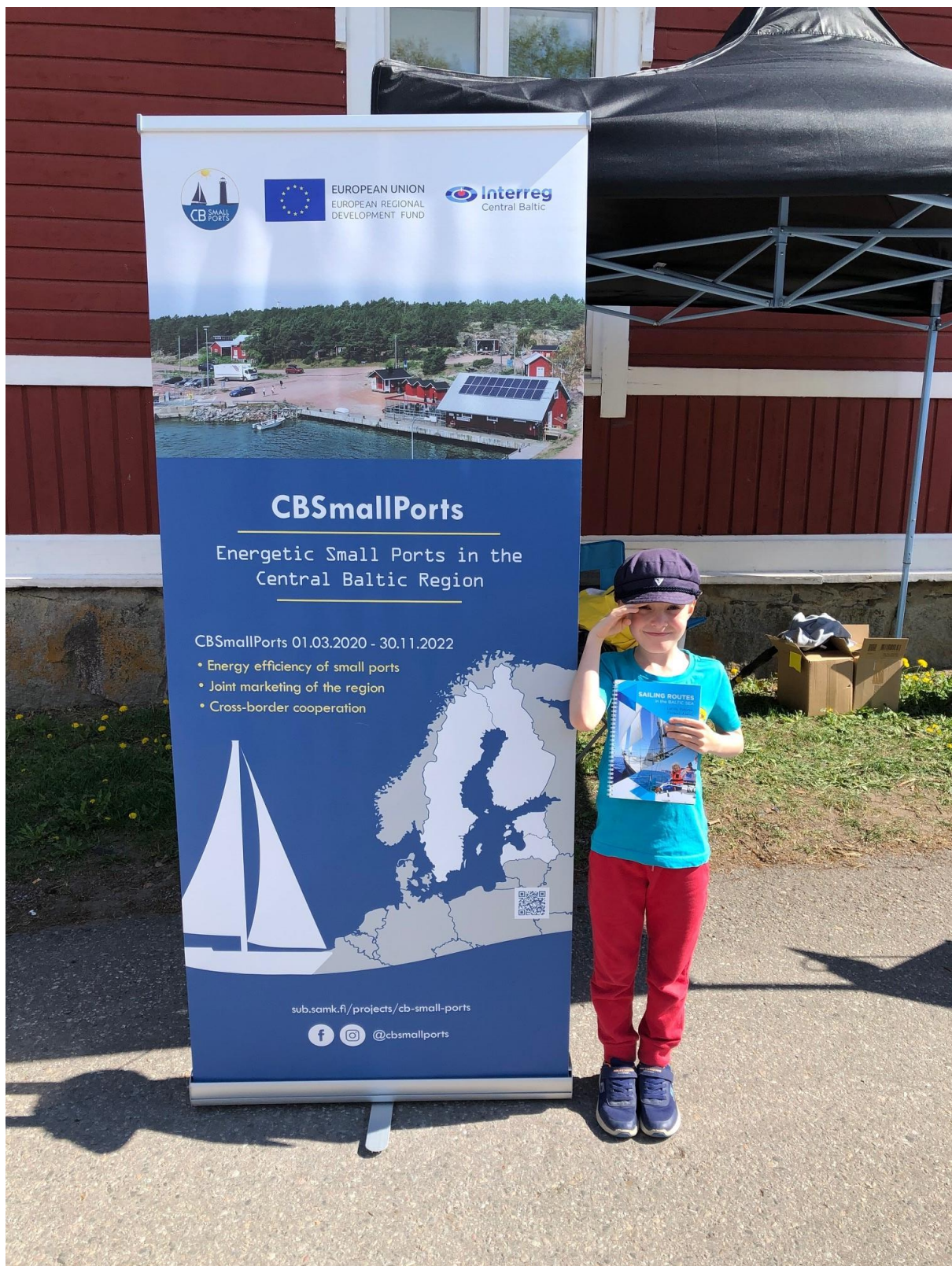
Photo 9. A younger visitor at CBSmallPorts outdoor “booth” at Naantali floating boat show 2022