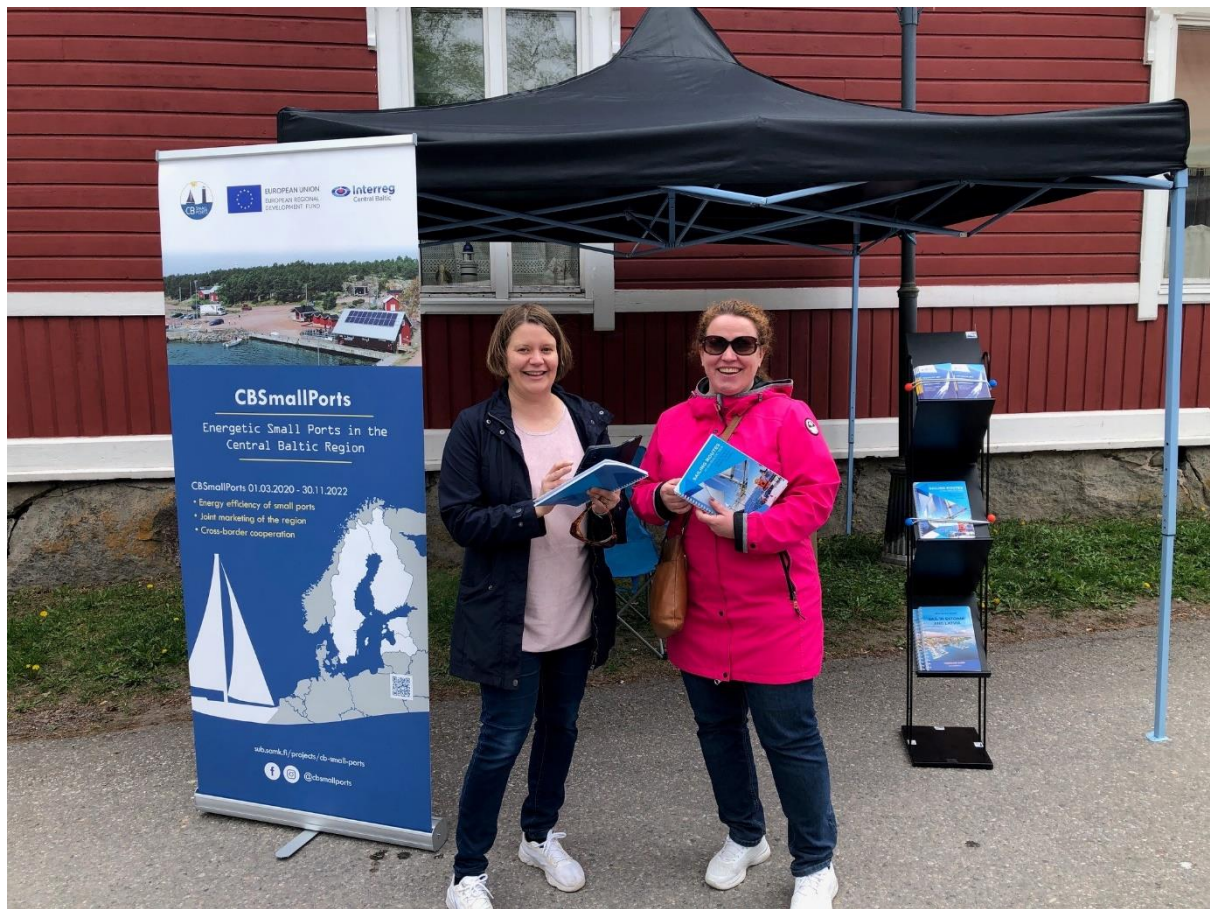
Photo 5. Visitors at CBSmallPorts outdoor “booth” at Naantali floating boat show 2022